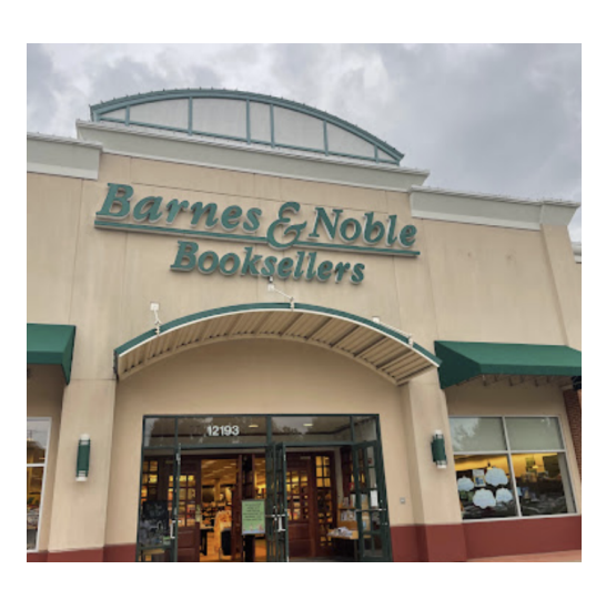
Barnes & Noble Book Signing -Fair Lakes