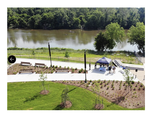
Fredericksburg Independent Book