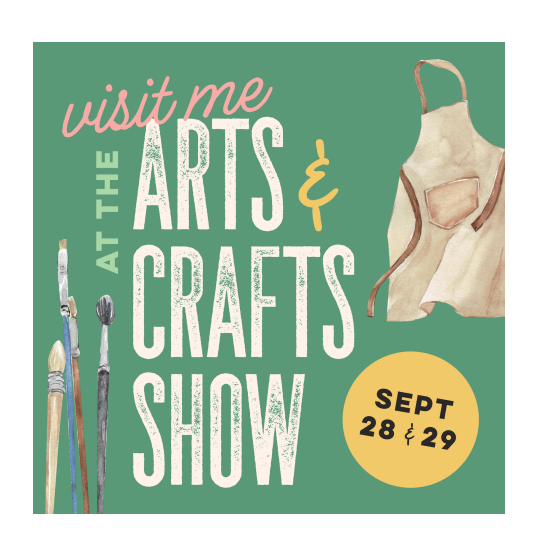
Occoquan Arts & Crafts Show

have to wait until Fall 2025 for more adventures on the Potomac Shores.